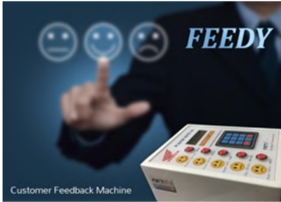
NETe Customer Feedback Machine