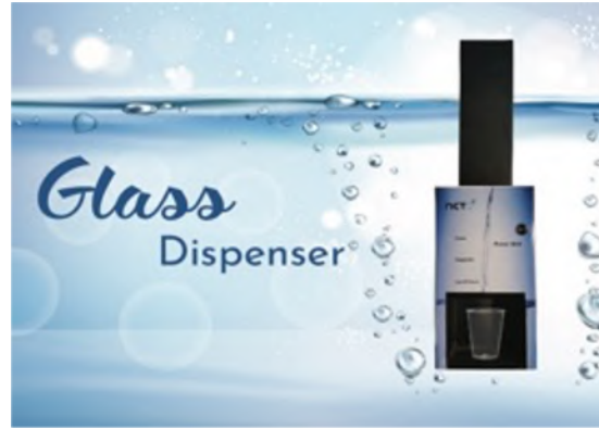
NETe Glass Dispenser