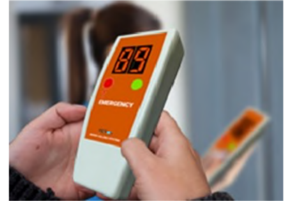
NETe Nurse Calling System